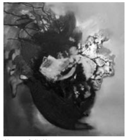
Abstract, Galia Kwetny, supplied photo.