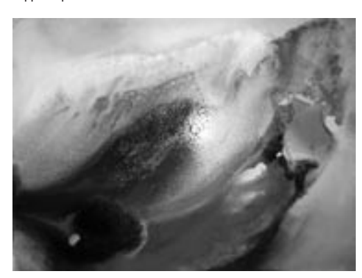
Abstract, Galia Kwetny, supplied photo.